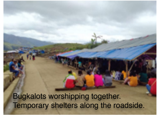
Bugkalots worshipping together. Temporary shelters along the roadside.