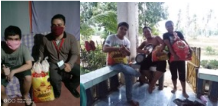
*Love in Action: Zamboanga Del Sur (2 pics above). Go to page 3, more about the Displaced Bugkalot Village